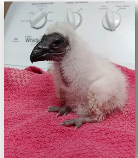
These young birds are great examples of our successes! (Left to Right) Young Red-shouldered Hawk (nick-named Isaac Newton) recovers from two broken wings and is released here at the Sanctuary. Displaced nestling Carolina Wrens and Blue Bird raised and released. Hatching Turkey Vulture identified and property owner instructed how to return it to its parents.