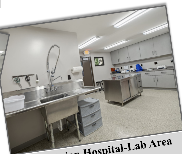
More Avian Hospital-Lab Area