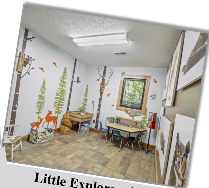
Little Explorers Room