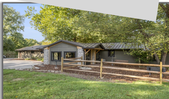
Front Elevation Visitor Center