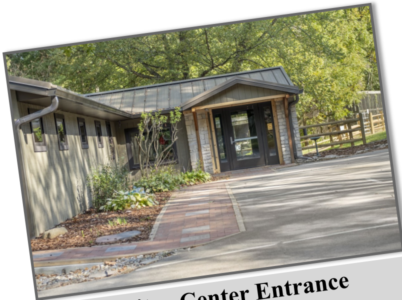
Visitor Center Entrance