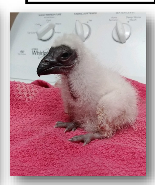
These young birds are great examples of our successes! (Left to Right) Young Red-shouldered Hawk (nick-named Isaac Newton) recovers from two broken wings and is released here at the Sanctuary. Displaced nestling Carolina Wrens and Blue Bird raised and released. Hatching Turkey Vulture

identified and property owner instructed how to return it to its parents.