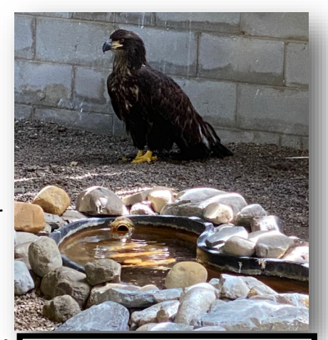
Juvenile Bald Eagle transferred from Ohio Wildlife Center for conditioning in flight cage.

The Bird Barn and Flight Complex were also crucial in providing space for the eight bald eagles we cared for this year. Seven of these were juvenile birds. It is amazing to witness how this species has made a comeback in our state!