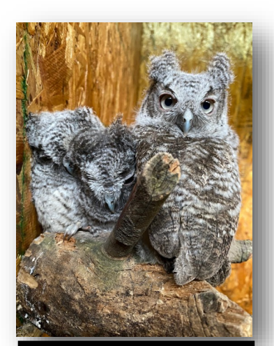
Fledgling Screech-Owls thriving in the seclusion of the Bird Barn.

Thankfully, we were able to prepare for this record year. During the shutdown in March, we used the time we were closed to the public to finish the Bird Barn, repair enclosures, and catch up on projects. The Bird Barn ended up being a lifesaver! The addition of three 8-foot by 8-foot rooms, plus extra space in the main area, allowed us