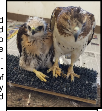
Rip the Red-tail hawk fostering injured fledgling

Hourly, compassionate individuals who have found injured or displaced birds, arrive with cardboard boxes in hand seeking assistance. The staff on many cases are able to provide information on how to return young birds to where they were found to be reunited with parents. Others are admitted and fed and cared for my the bird care staff and summer interns. This summer we have received a number of nestling raptors needing care. These are very carefully raised without seeing humans to avoid socialization and have been successfully foster by our educational birds.