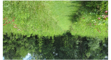
Trail maps are available in the Visitor Center.

3774 Orweller Road, Mansfield, OH 44903 Phone (419) 884-HAWK